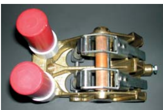
GE761 2 pocket reaction holder OEM P/N 8843525G03