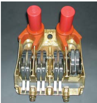
D87B 4 pocket holder OEM P/N 9550251