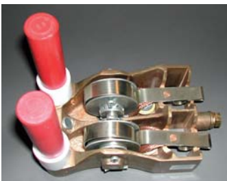
GE761 2 pocket radial holder OEM P/N 8843525G01